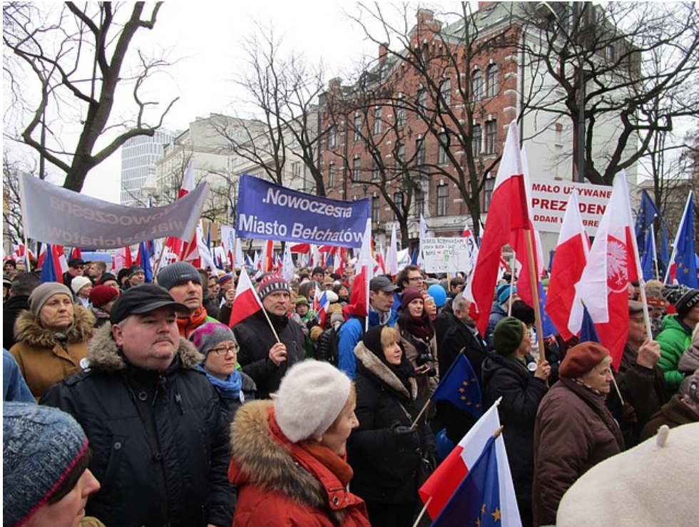
On 12 March 2016 one of the largest anti-government demonstrations took place in Warsaw. The demonstration consisted of various parties and movements from all across the political spectrum.