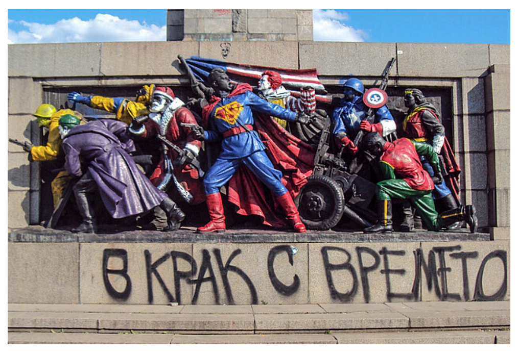
Soviet army memorial in Sofia, June 2011 Author: Ulrike Schult