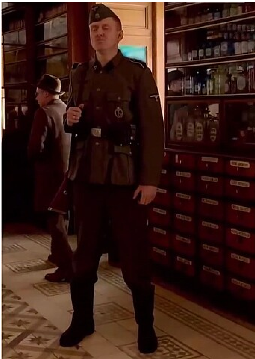
German soldier at the confiscation of the pharmacy.

Snapshot from @eva-stories; @eva.stories