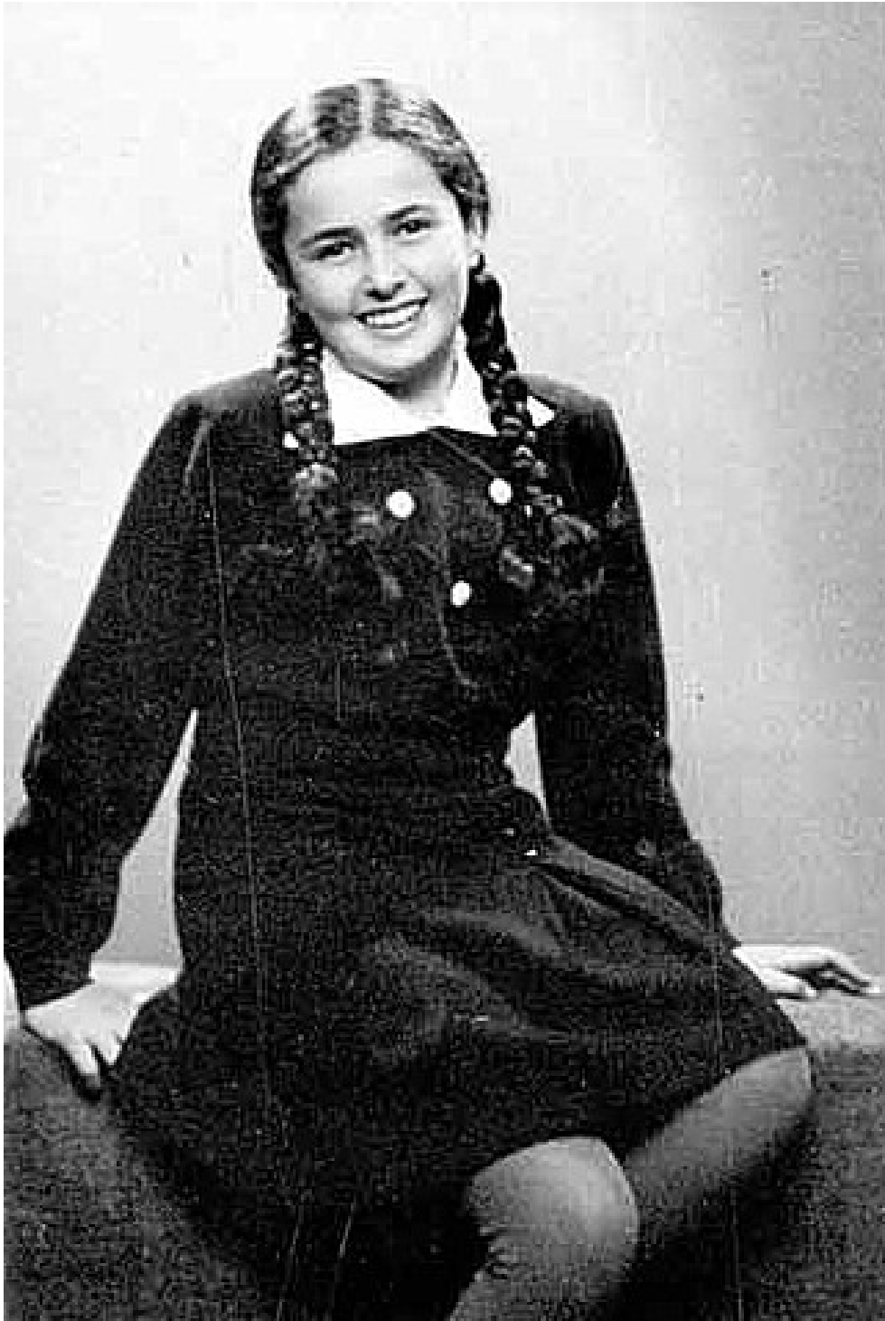
Portrait of the 13-year-old Éva Heyman, shortly before her deportation (1944).