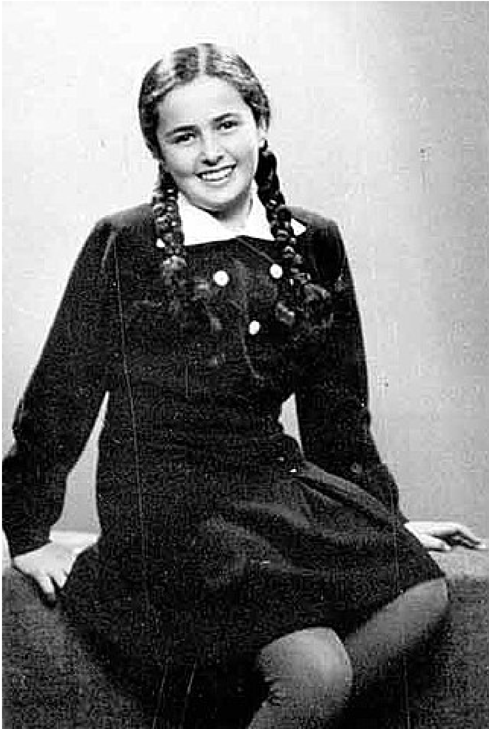
Portrait of the 13-year-old Éva Heyman, shortly before her deportation (1944).

Author: unknown; Brandnewwta [CC BY-SA 4.0 ( https://creativecommons.org/licenses/by-sa/4.0/ )]