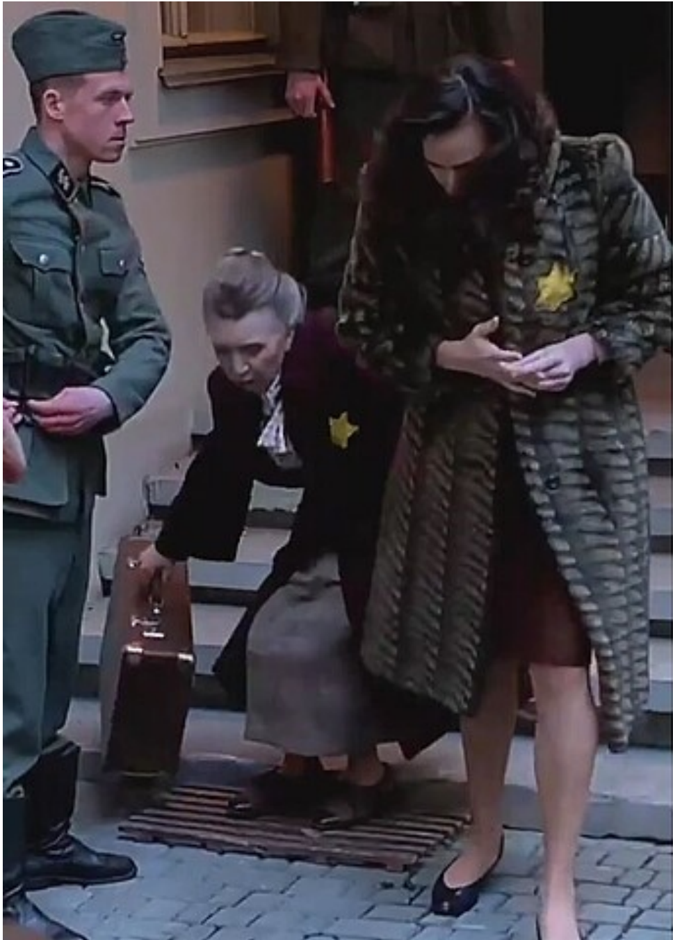
German soldier during the ghettoisation of the family.