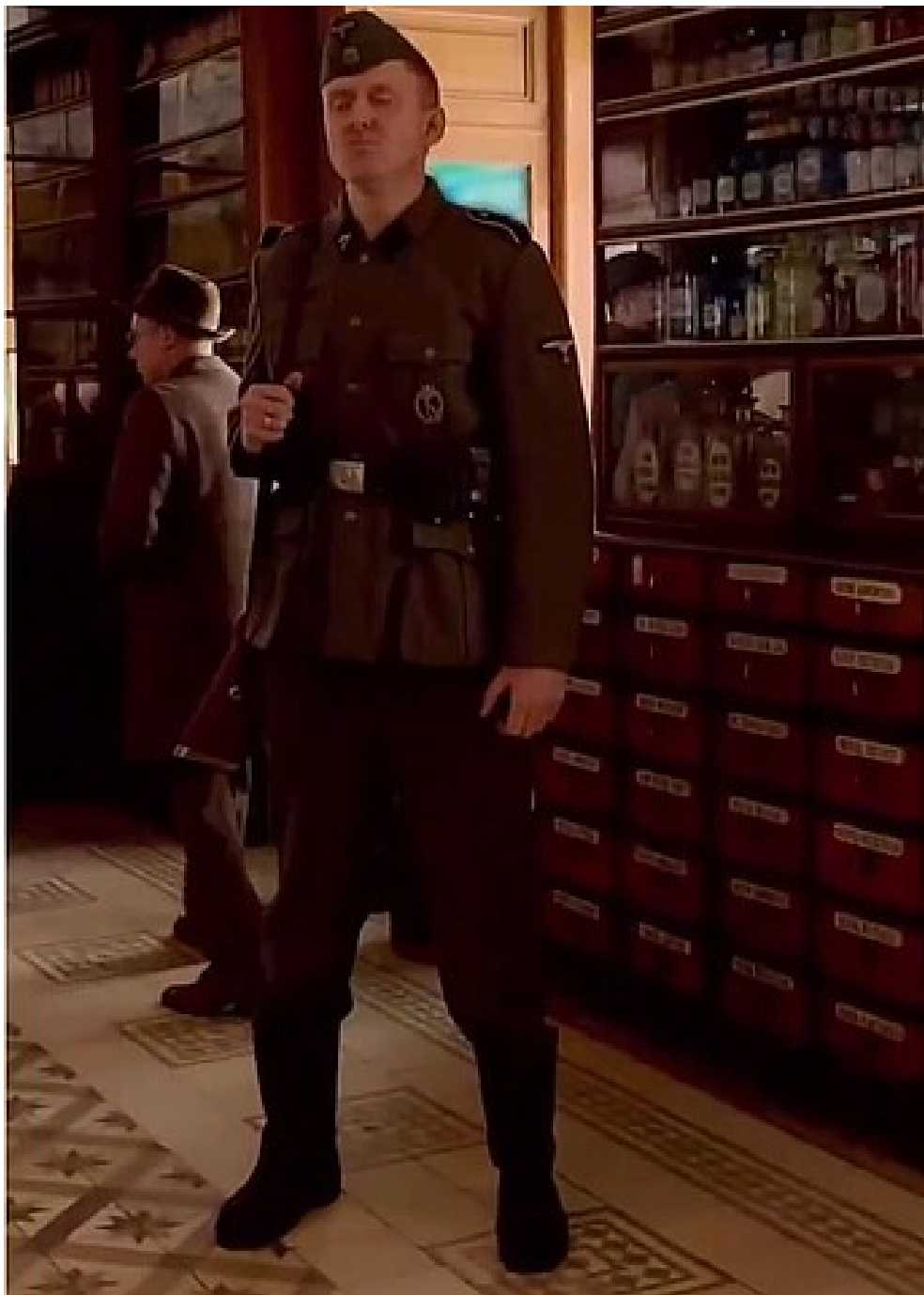
German soldier at the confiscation of the pharmacy.