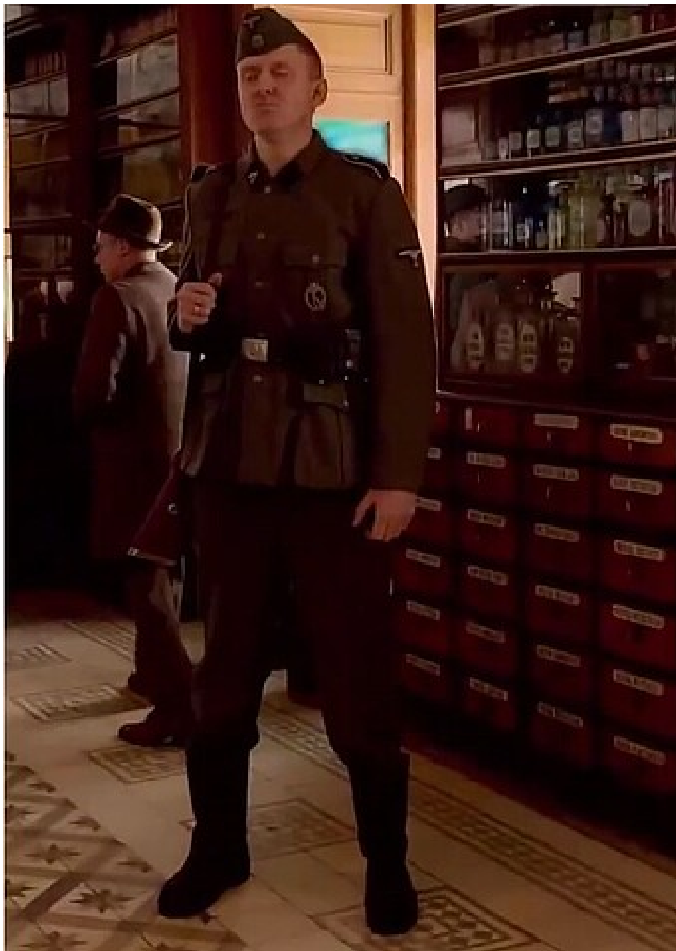
German soldier at the confiscation of the pharmacy.

Snapshot from @eva-stories; @eva.stories