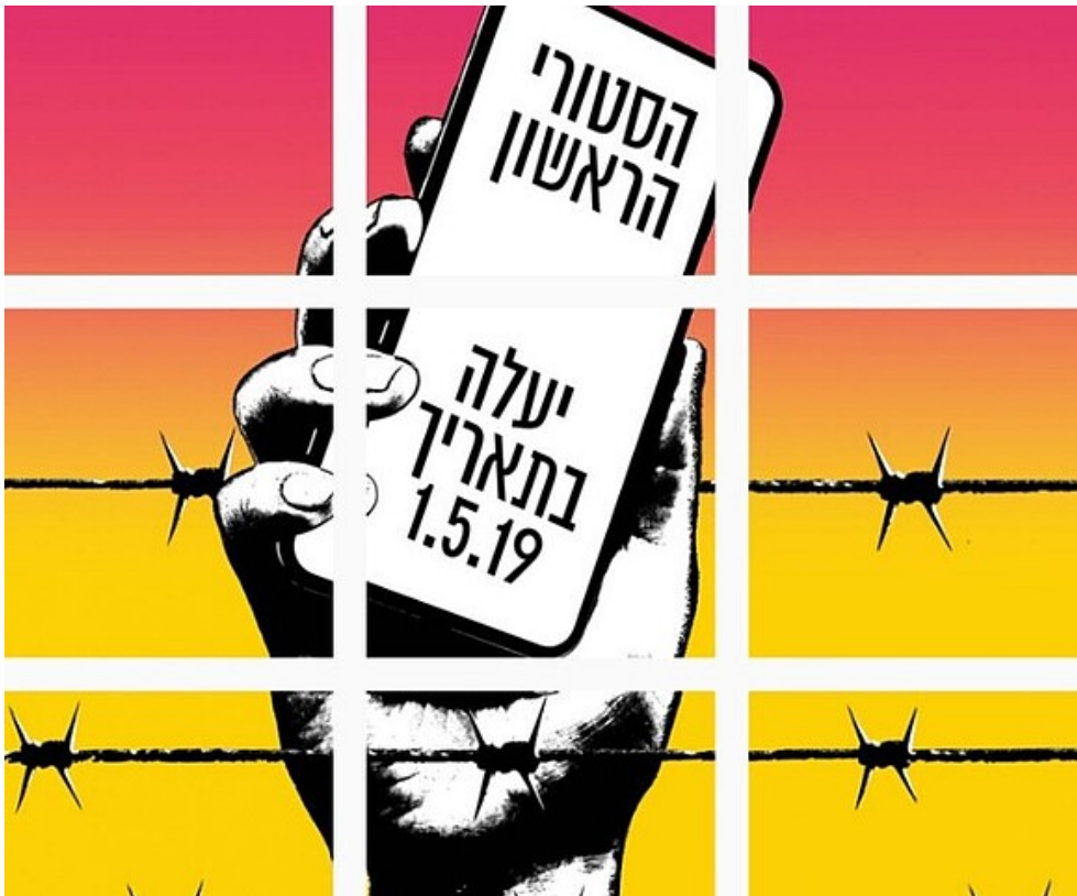
The main image that advertised the eva.stories project