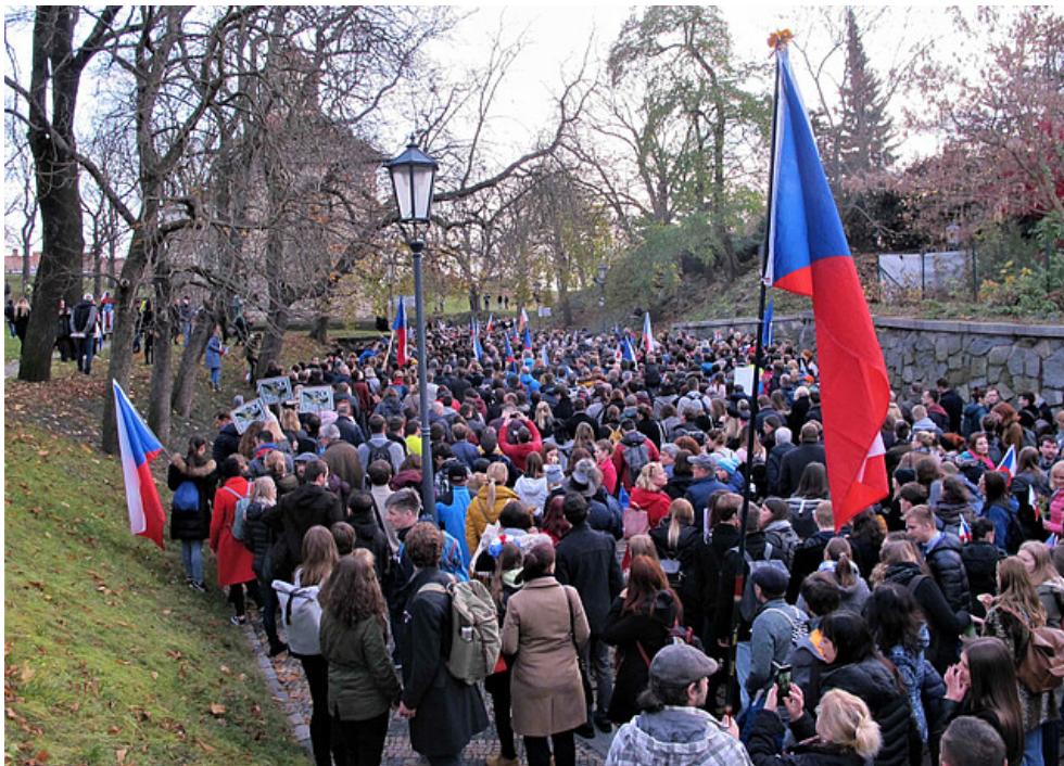
Reconstruction of the Prague march of 17 November 1989