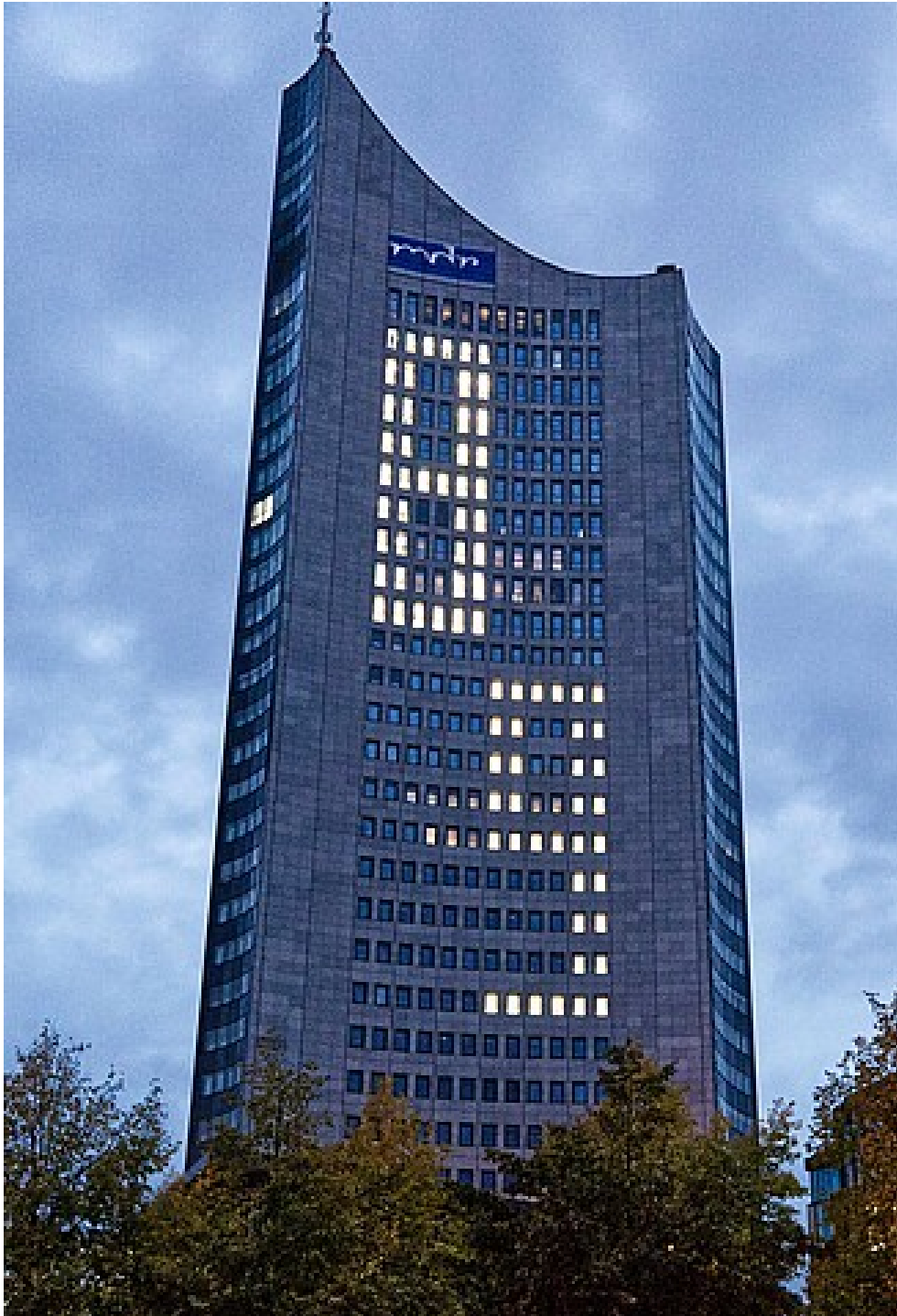
The building of Mitteldeutscher Rundfunk (MDR) in Leipzig, using its windows to write "89" in commemoration of the revolution Author: Andrew Kloiber