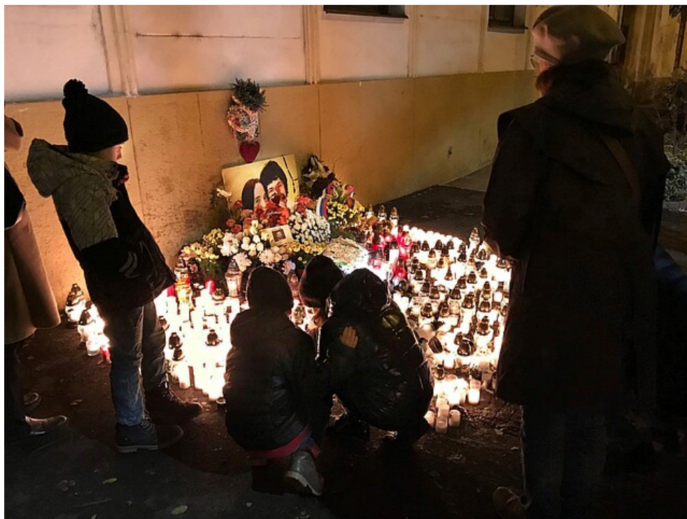
The makeshift memorial to the murdered journalist Ján Kuciak and his fiancée Martina Kušnírová on SNP Square in Bratislava