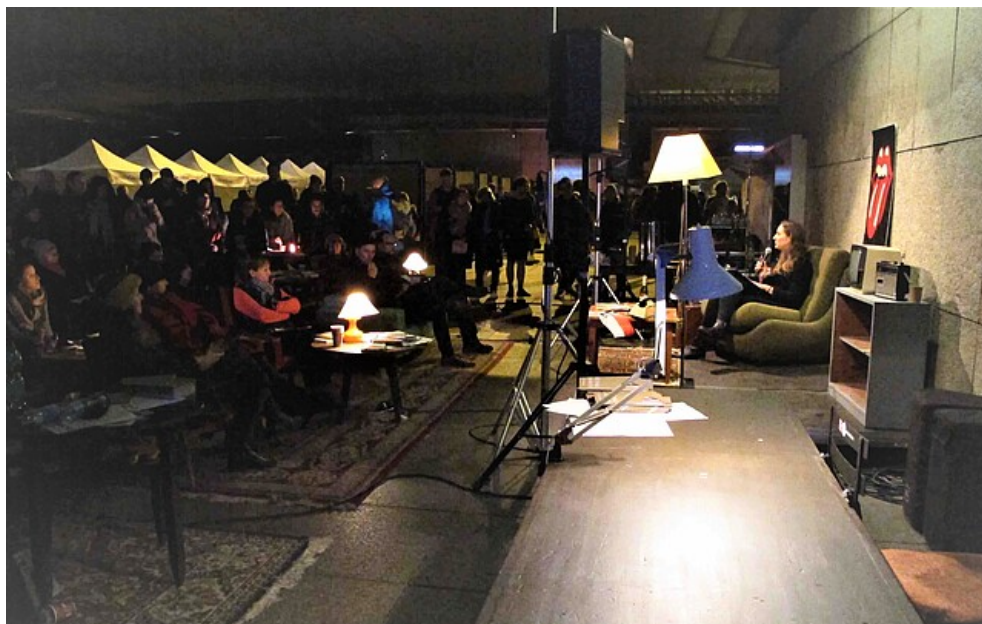
A woman reads from one of Václav Havel's texts in 'Havel's Living Room', set up alongside the National Theatre in Prague Author: James Krapfl