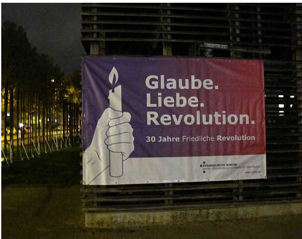
"Faith. Love. Revolution. 30 Years Peaceful Revolution" – a poster outside Berlin's Chapel of Reconciliation on Bernauer Strasse