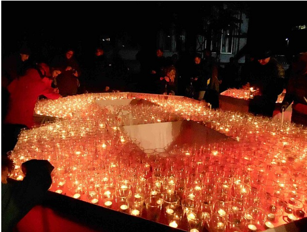
Leipzig's Lichtfest: attendees place candles in large frames to spell "Leipzig 89" outside the Opera House on Augustusplatz