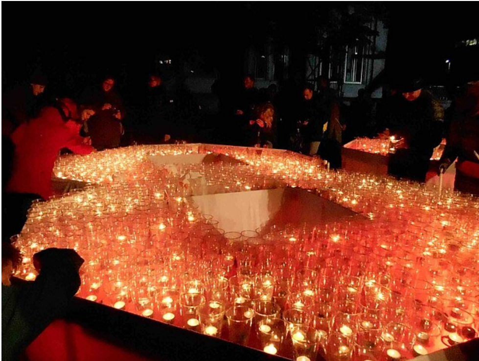
Leipzig's Lichtfest: attendees place candles in large frames to spell "Leipzig 89" outside the Opera House on Augustusplatz