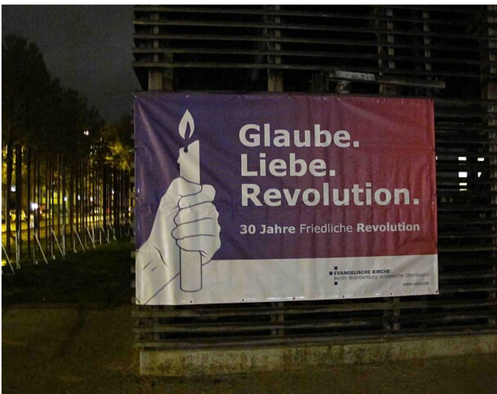
"Faith. Love. Revolution. 30 Years Peaceful Revolution" – a poster outside Berlin's Chapel of Reconciliation on Bernauer Strasse