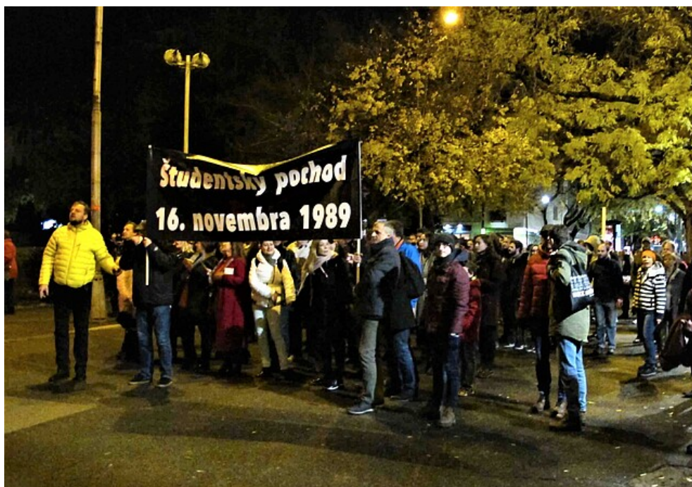
Recreation of the Bratislava student march of 16 November 1989 Author: James Krapfl