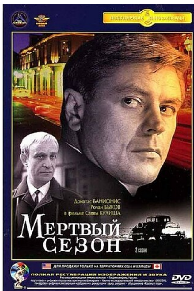
DVD cover of the 1968 Russian spy movie 'Dead Season' (Mertvyy sezon), with Lithuanian actor Donatas Banionis