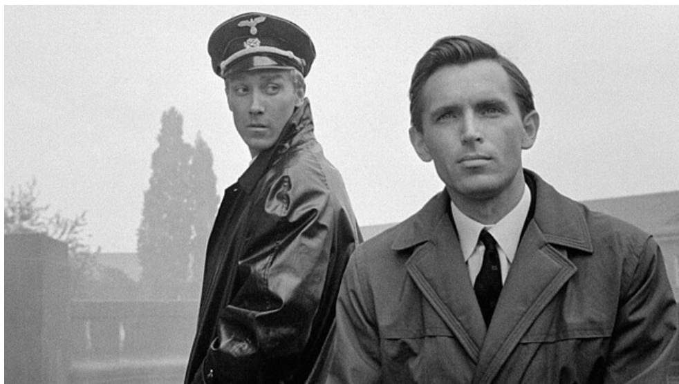
Backdrop image to the TV series 'Shchit i mech', featuring Stanislav Lyubshin as Johann Weiss and Oleg Yankovskiy as Heinrich Schwarzkopf