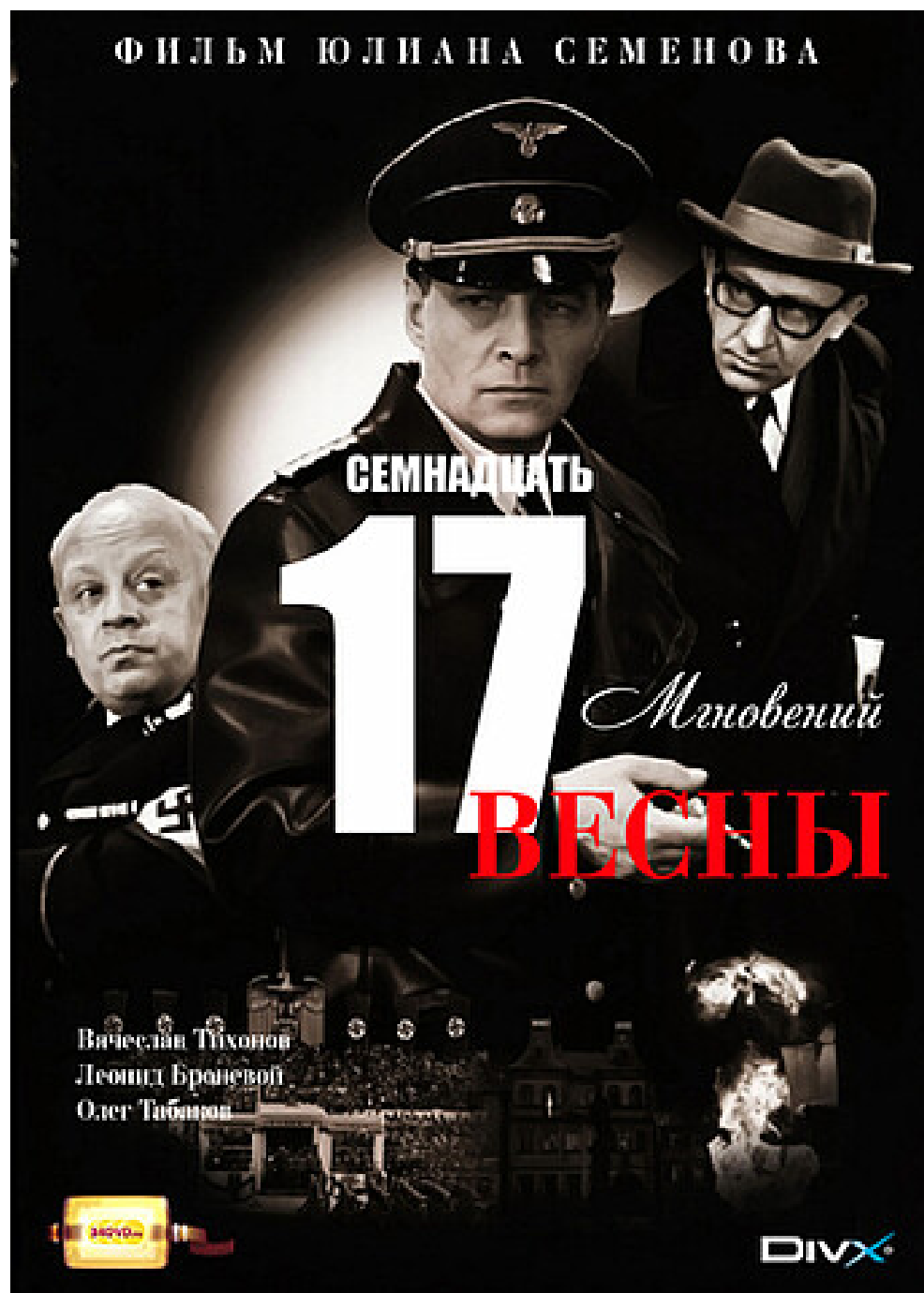
DVD cover of the 1972 TV series 'Seventeen Moments of Spring'