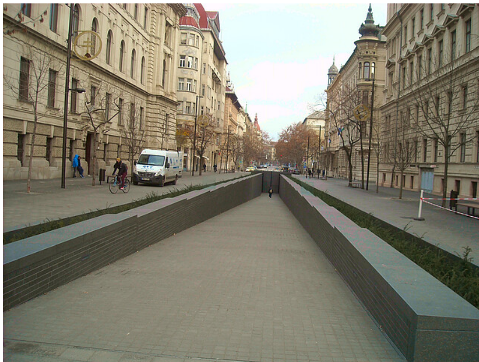
The entrance to the memorial ramp on Alkotmány utca, Budapest