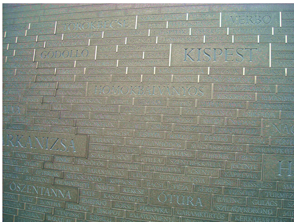
The walls on both sides are covered with the names of localities that were once part of pre-Trianon Hungary