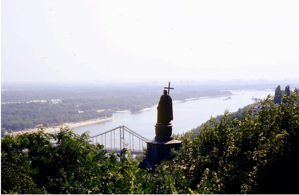
Saint Volodymyr Monument in Kyiv, 1975.