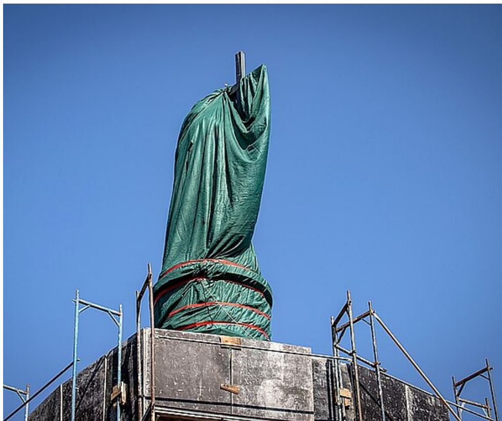
The statue of Saint Volodymyr in Kyiv is being protected during the Russian invasion of Ukraine.