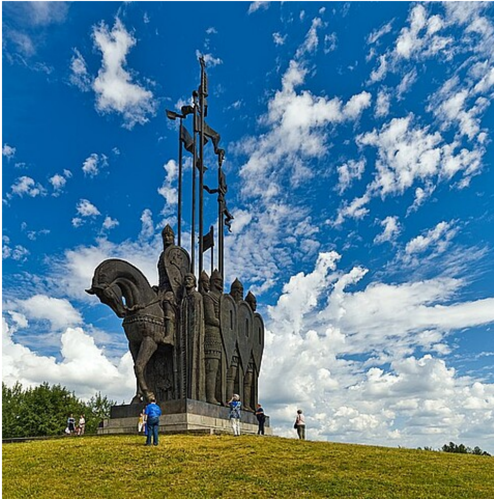
Old Nevsky Monument in Pskov, Russia.