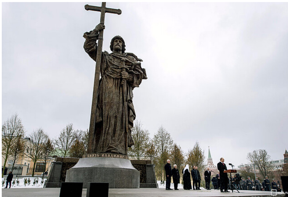
A new prince Vladimir I monument is being unveiled in Moscow, 4 November 2016.