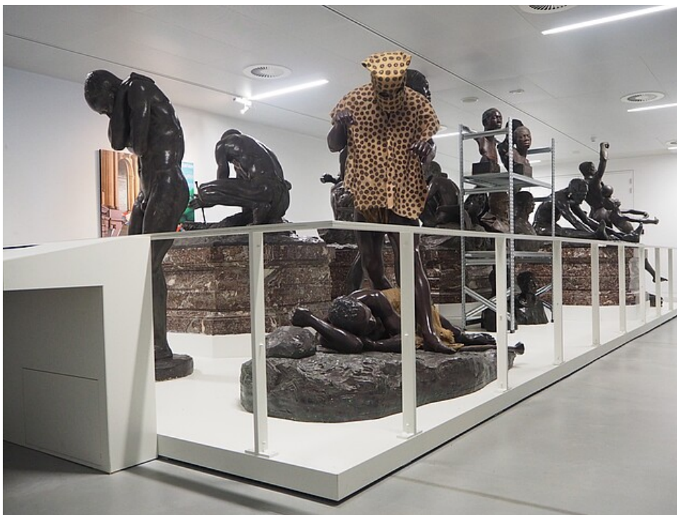
"This is how we looked at Africa before" - open depot in the basement of the museum.