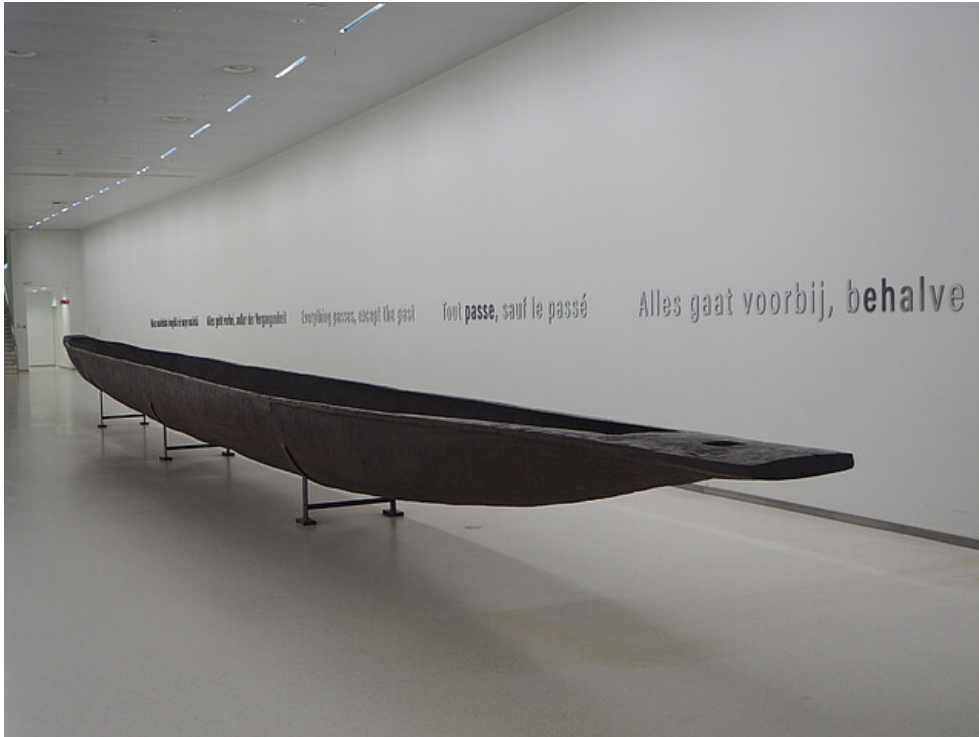
The pirogue that ferried King Leopold III down the Lualaba River in 1957 - on the back wall the inscription: "Everything passes except the past".