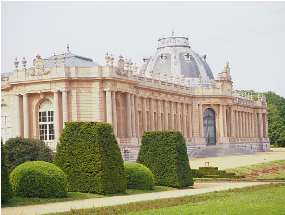
The building of the RMCA