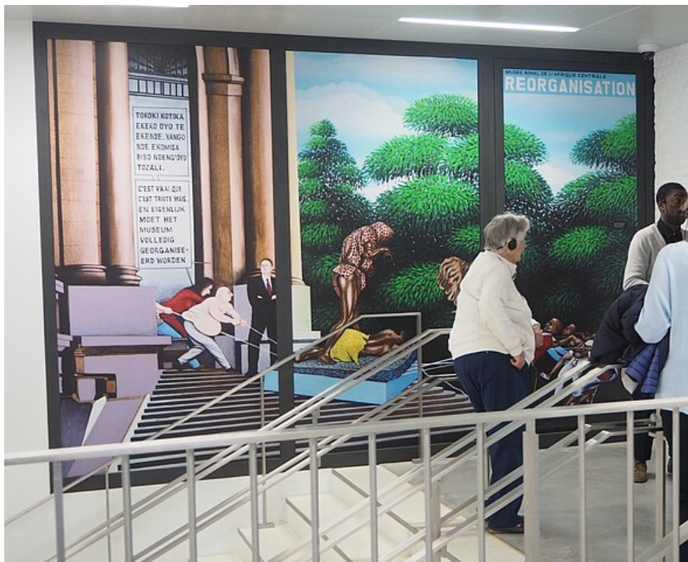
Enlarged painting by Congolese artist Chéri Samba entitled 'Réorganisation' and placed at the end of the underground corridor connecting the visitor Centre with the old museum building.