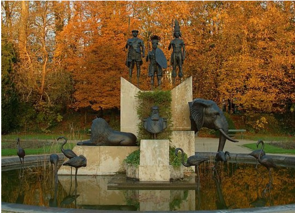
The bust of Leopold II with sculptures of Congolese people and animals - before it was defaced