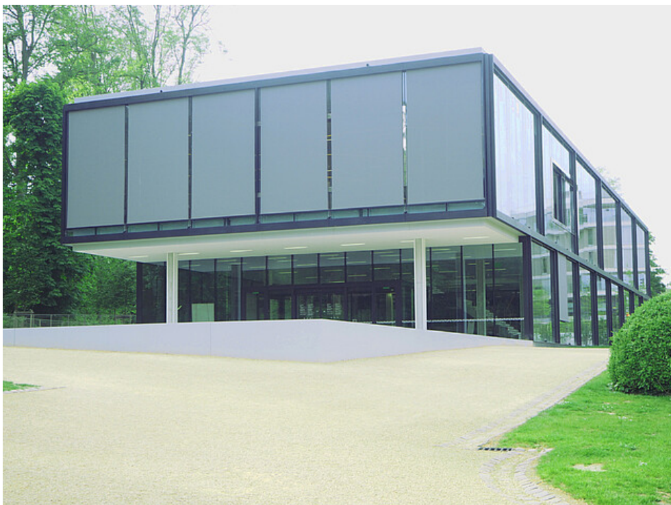
A brand new visitor Centre in modernist style has been added to the RMCA.