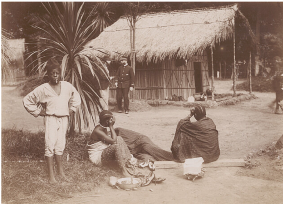
A human zoo: Congolese village at the 1897 Brussels International Exposition in Tervuren