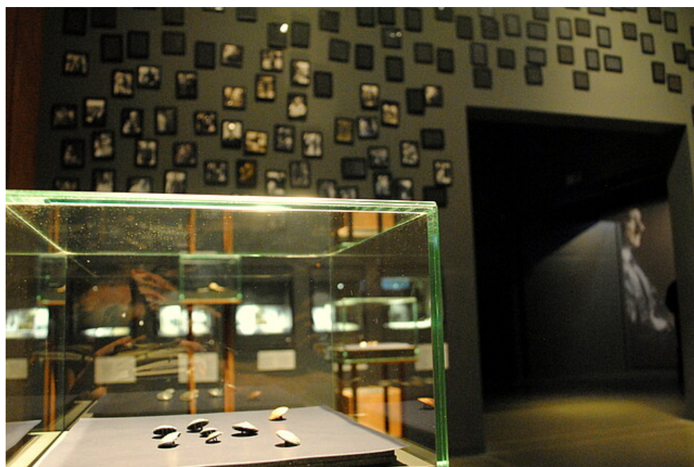
Buttons from the uniforms of Polish officers killed in Katyn Author: Andrzej Hoja