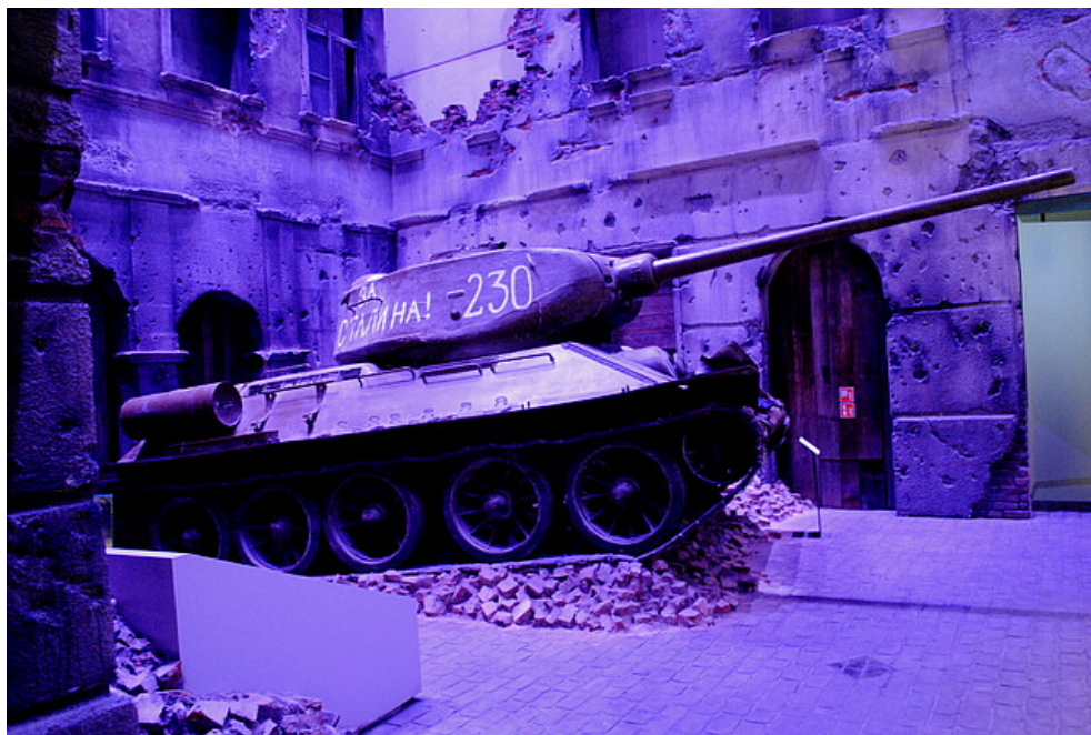
A Russian T-34 tank among the rubbles of a ruined city street