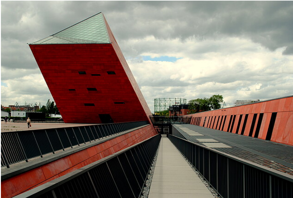
The building of the Museum of the Second World War in Gdańsk Author: Andrzej Hoja