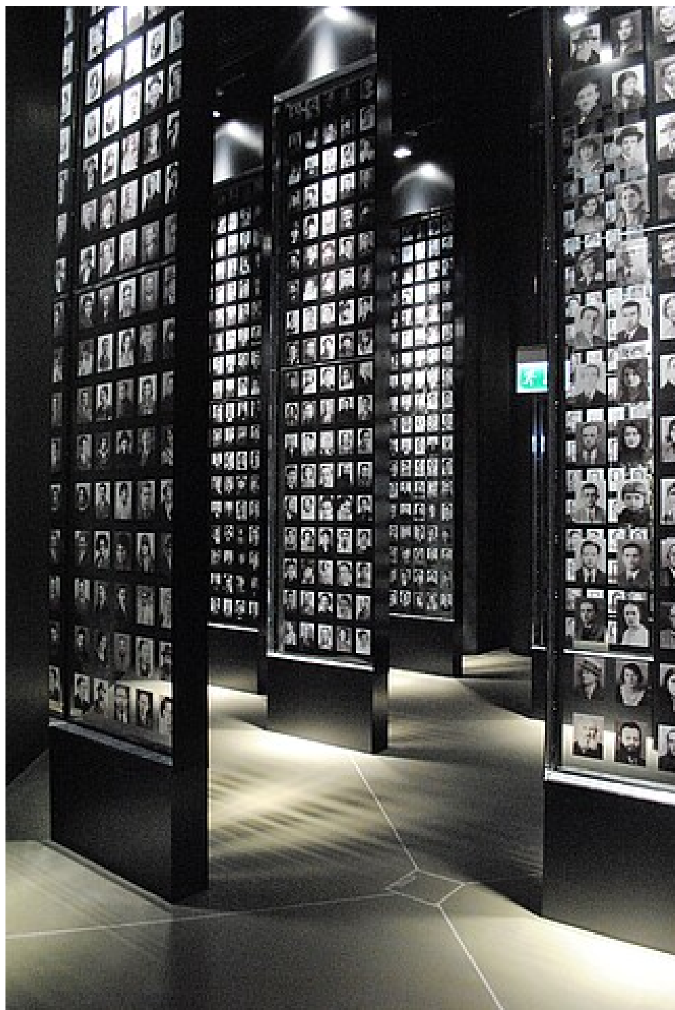
A part of the scenography in the Holocaust section Author: Andrzej Hoja