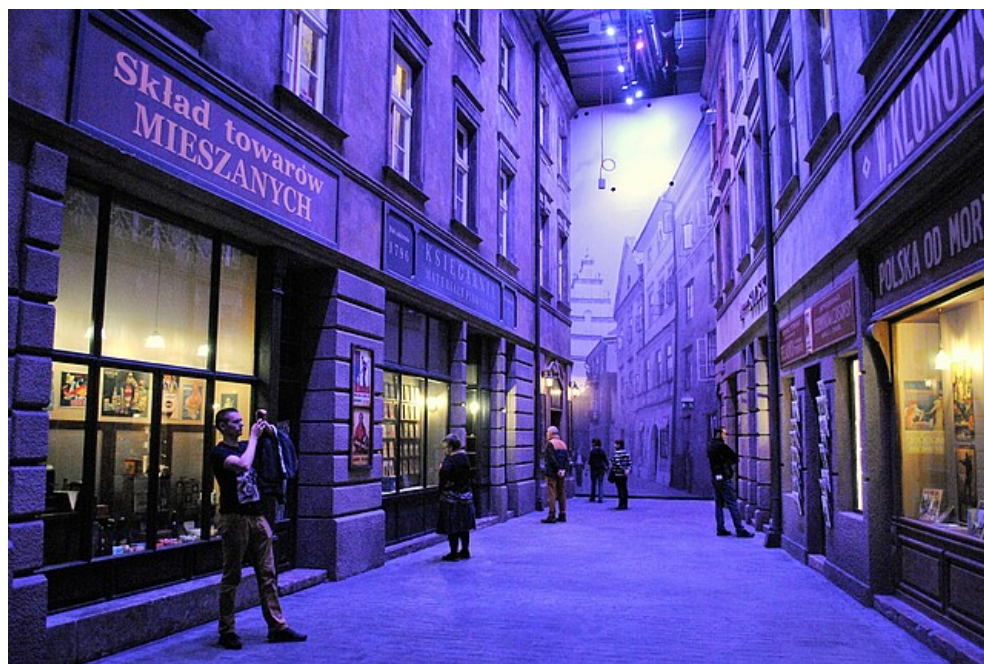
A Polish inter-war street scenography