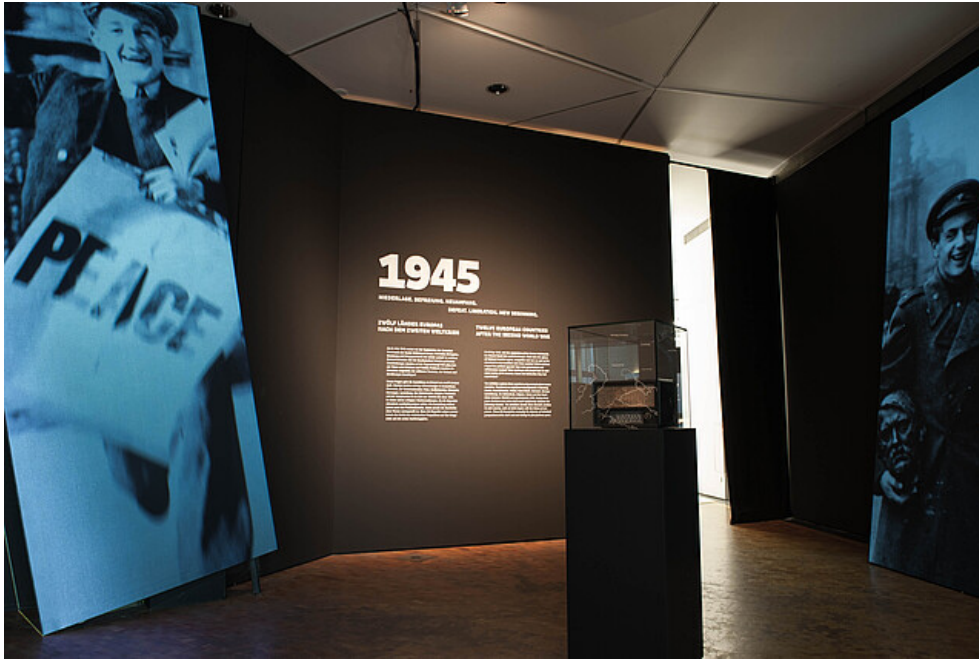
The first exhibition space and the introductory text