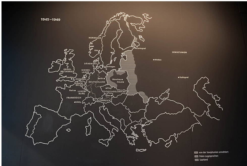
Map of Europe with post-World War II borders in the first exhibition space Author: Michal Korhel