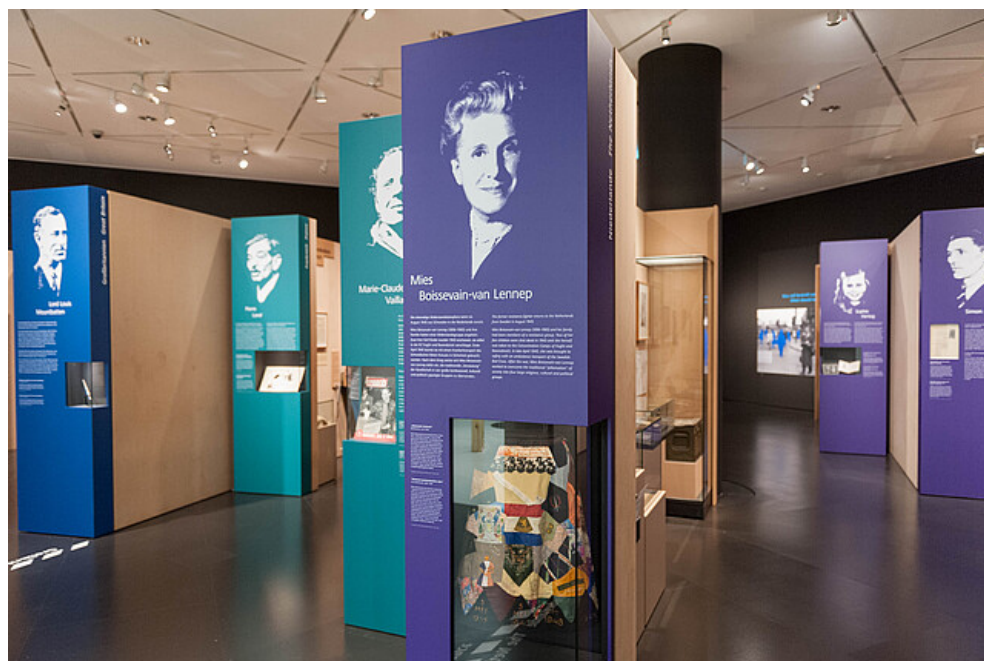
Biographies for Great Britain, France, and the Netherlands hang next each other