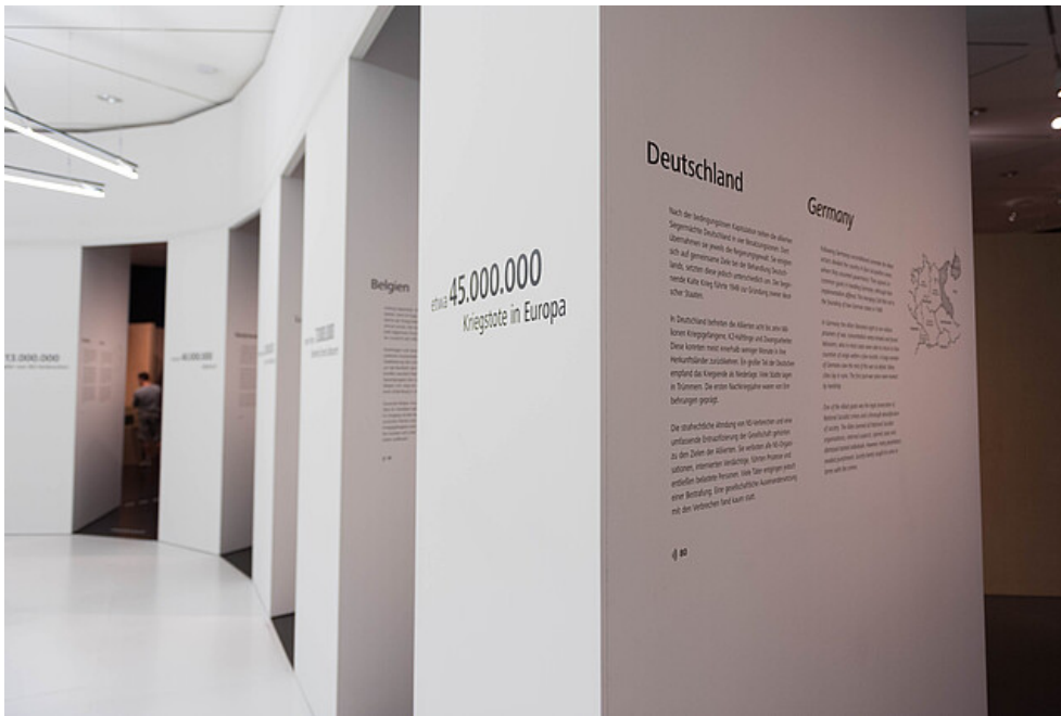
Introductory text on Germany Author: Michal Korhel