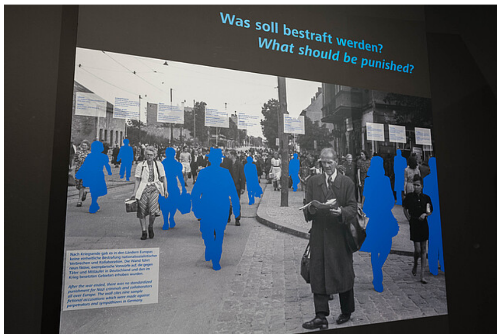
Installation: 'What Should Be Punished?'