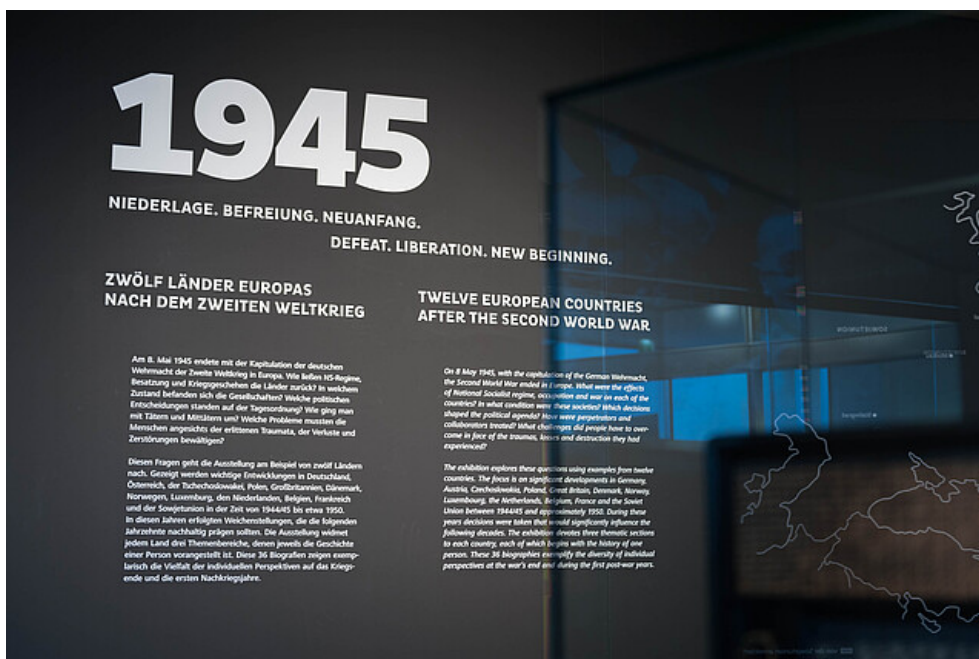
Introductory text in the first exhibition space Author: Michal Korhel