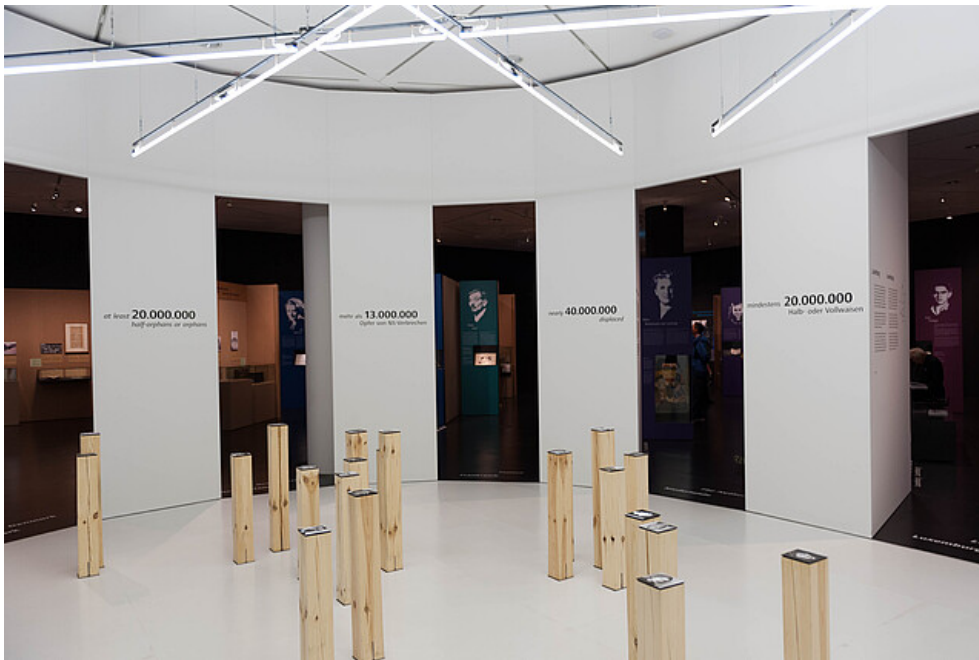
Wooden stiles In the second exhibition space, numbers of war dead and biographies in the background Author: Michal Korhel