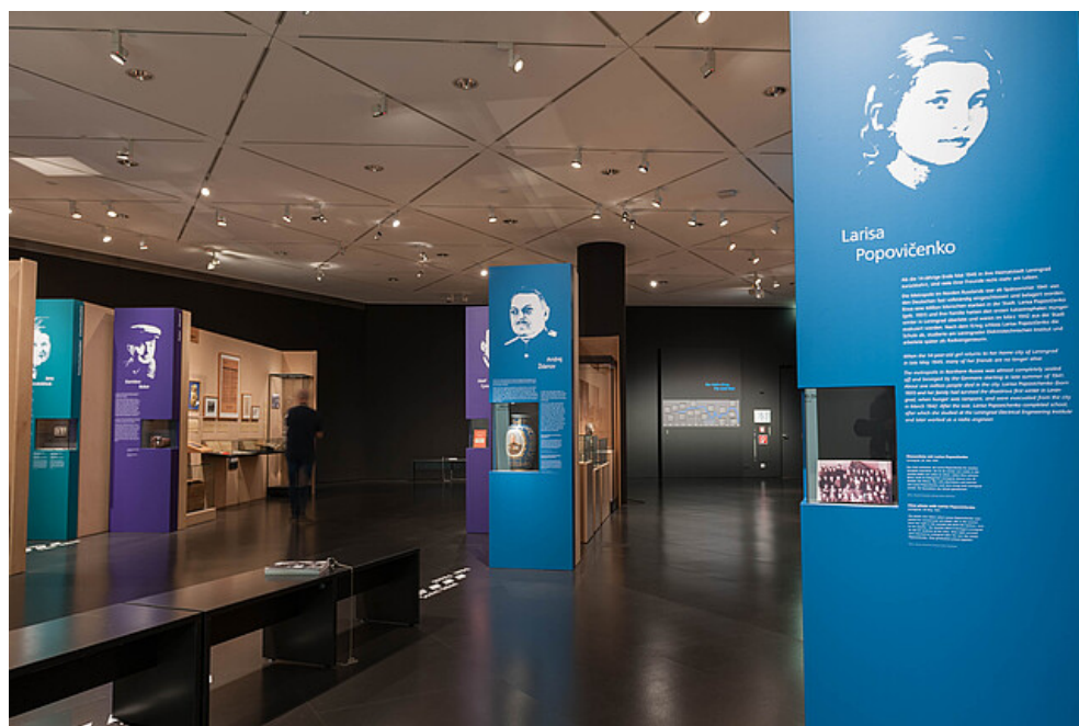
View through the biography section into the object section (Poland and the Soviet Union) Author: Michal Korhel