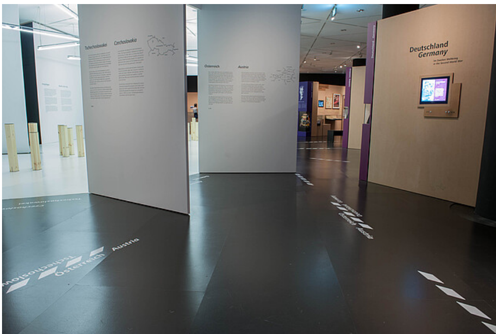
View of the introductory section: wooden stiles in the foreground, country texts, biographies, and objects in the background Author: Michal Korhel