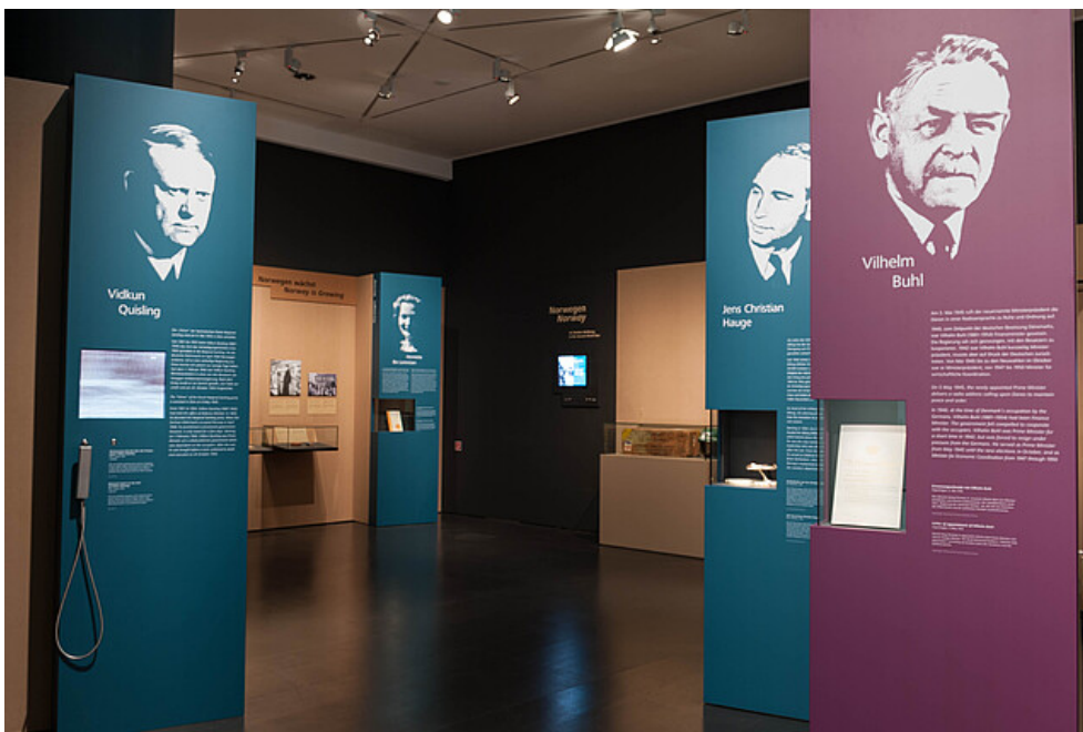
Biography section; Norway on the left Author: Michal Korhel