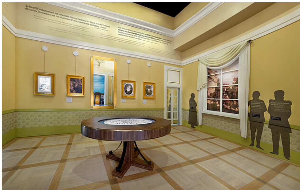
Gallery "Challenges of Modernity"