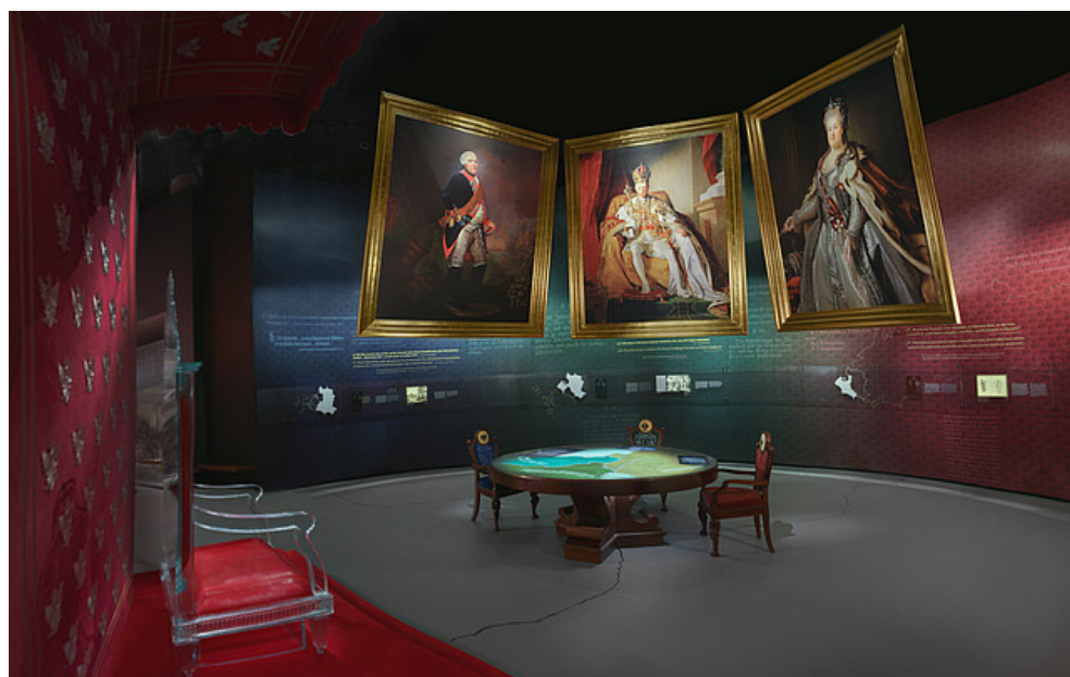
Gallery "Challenges of Modernity"