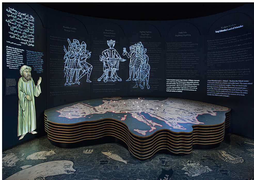
The first gallery "First Encounters"