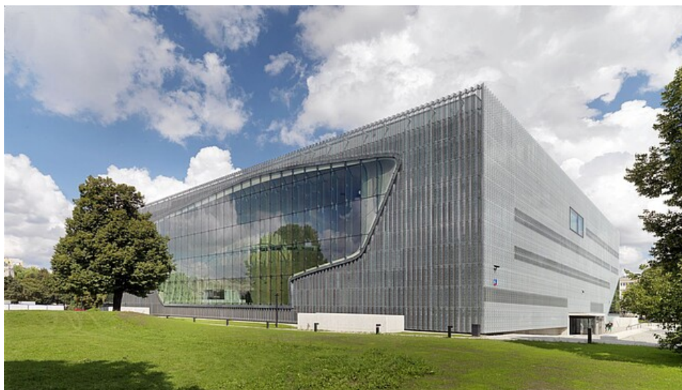
The building of the museum

Author: W. Kryński Copyright: Muzeum Historii Żydów Polskich POLIN