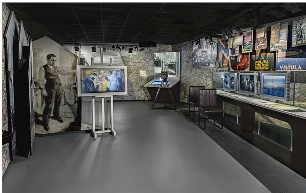
Gallery "On a Jewish Street"