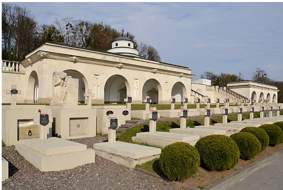
Cemetery of the Defenders of Lwów (the 'Eaglets of Lwów') in Lviv, Ukraine