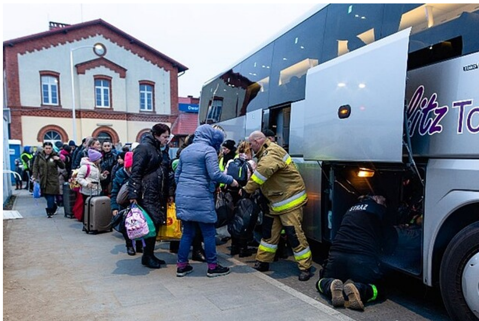
Refugees from Ukraine arriving in Poland, March 2022, Rzepin