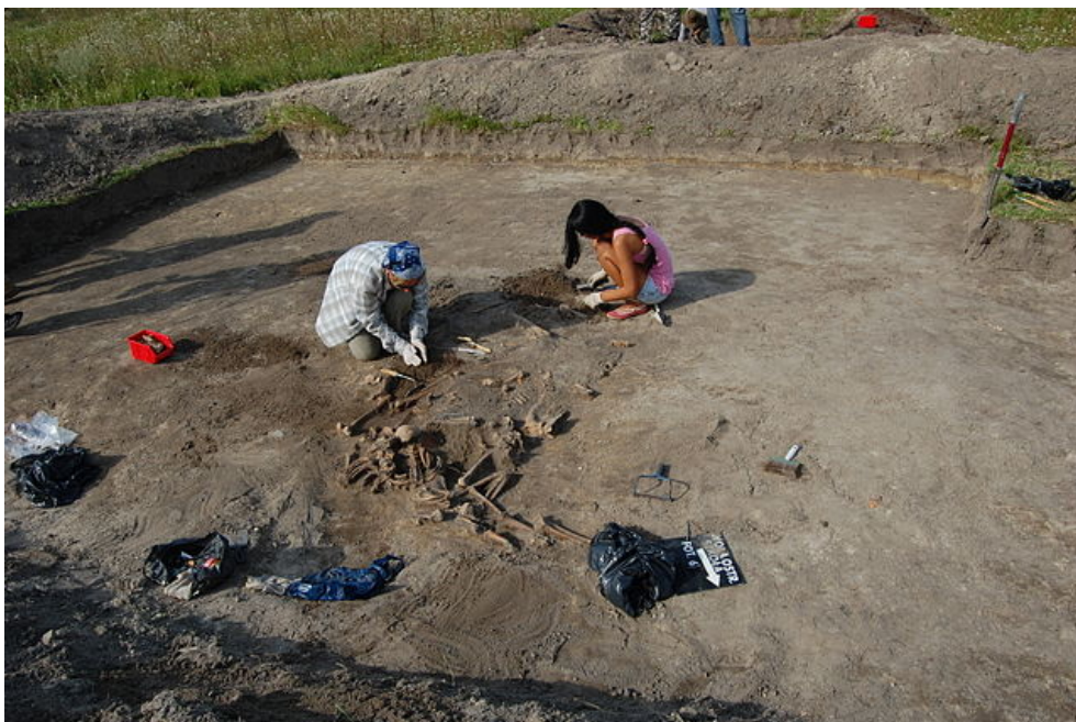
An exhumation in Wola Ostrowiecka, the site of 1943 mass killings in Volhynia