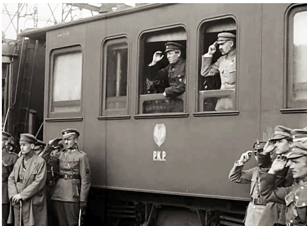
Polish president Józef Piłsudski (right) and Ukrainian army leader Symon Petliura forge a short-lived alliance against the Bolsheviks during the Polish-Soviet war, 1920/21.