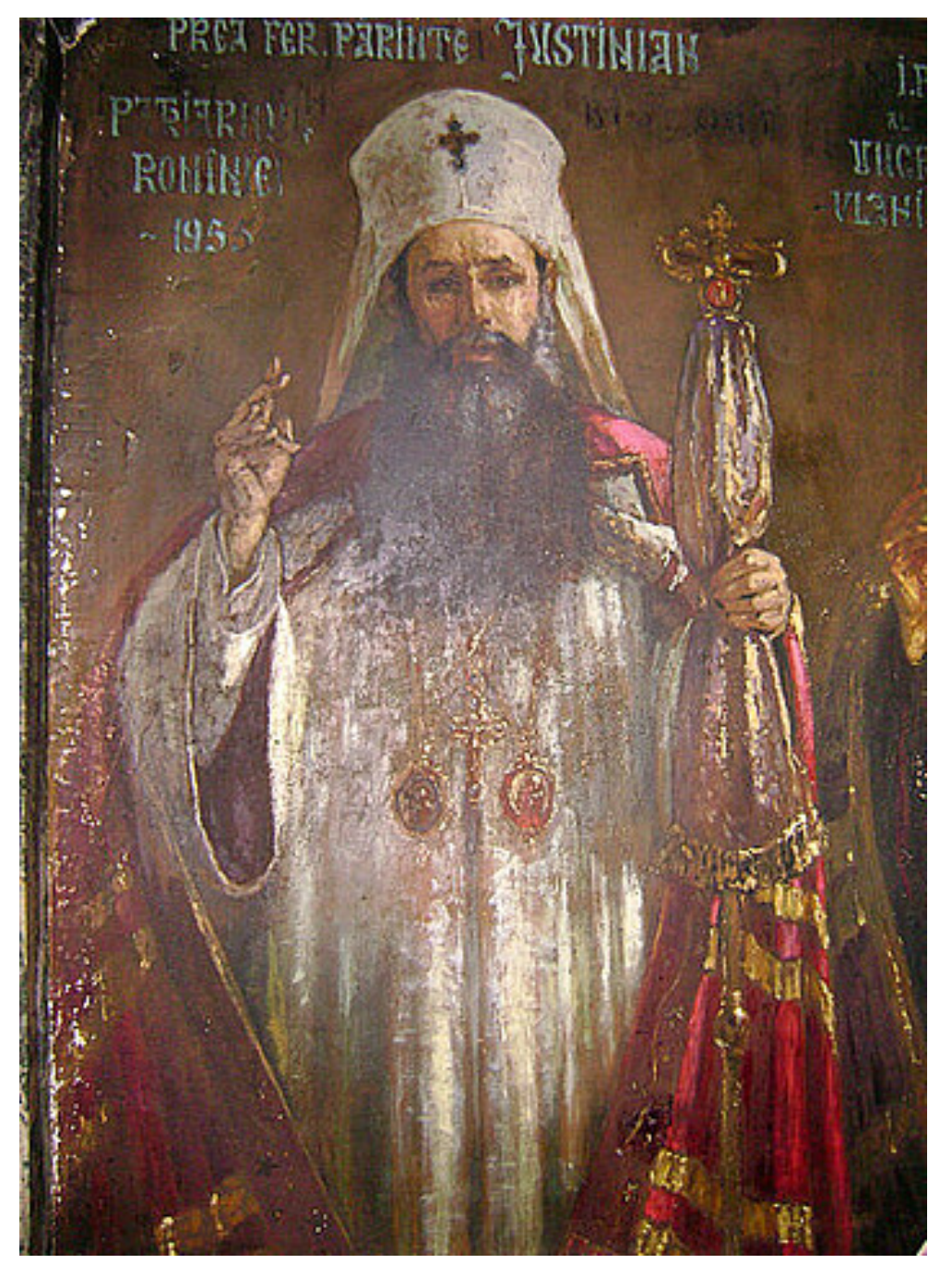
Patriarch Justinian Marina painted inside the walls of Saint Spyridon the New Church