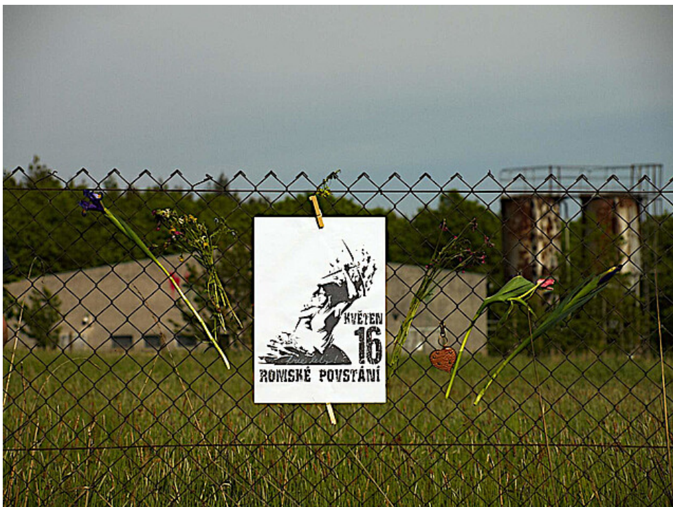
Visual signs of protest often appear on the fences that surround the pig farm in Lety