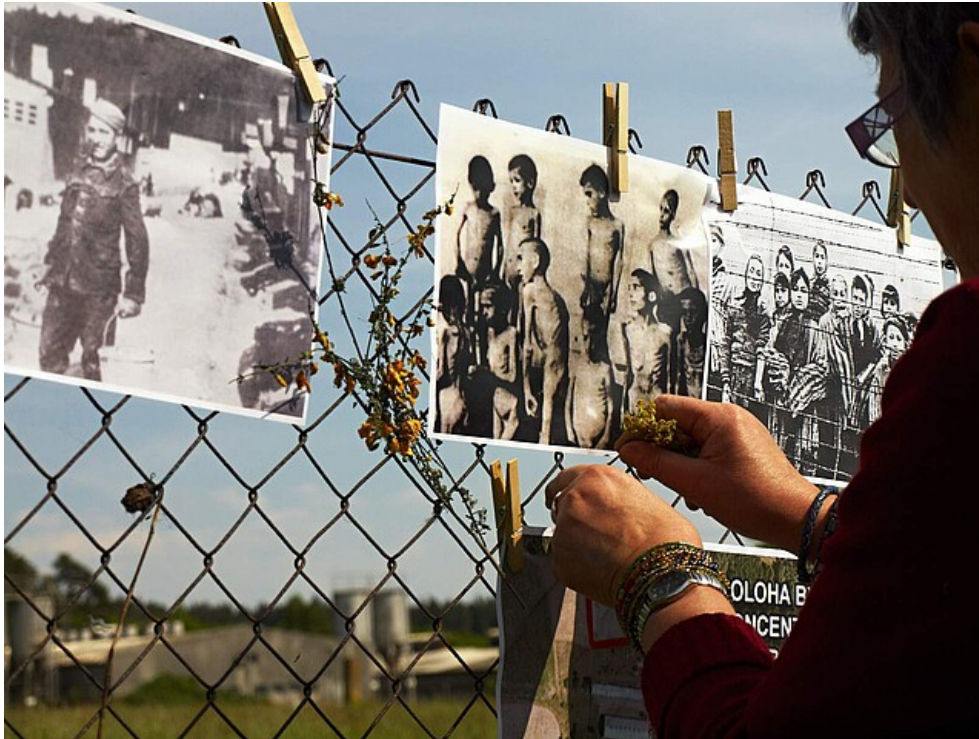
Memory activists attach pictures of Romani genocide victims to the fence in Lety