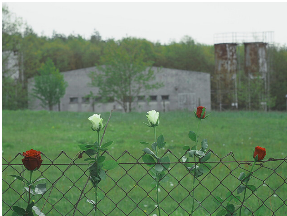
Flowers attached to the fence that surrounds the contested pig farm in Lety