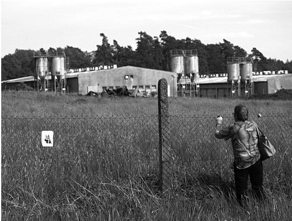
Full view of the pig farm that stands on parts of former concentration camp site in Lety, 2015