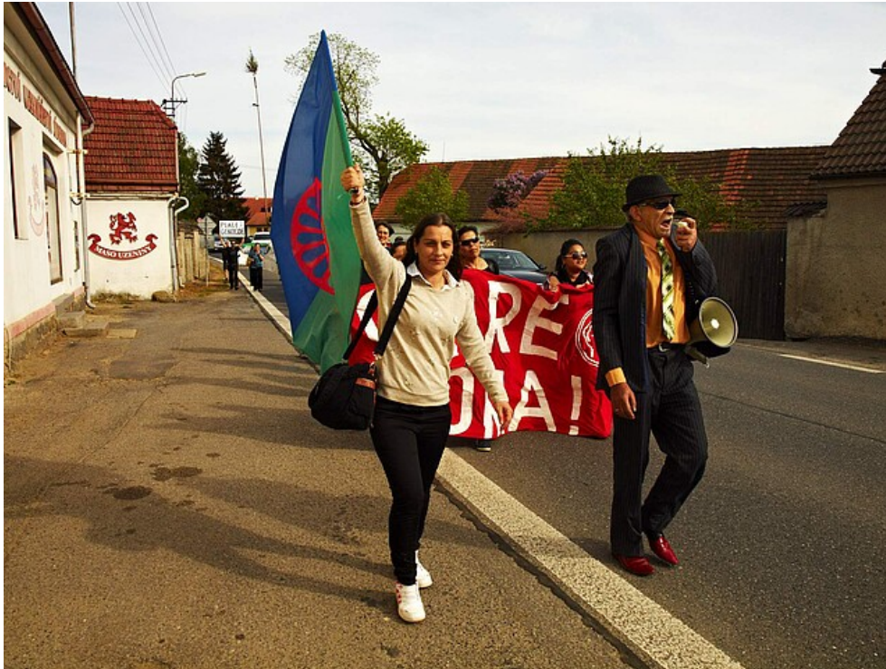
Protesters march from the former camp site to Lety village in 2015