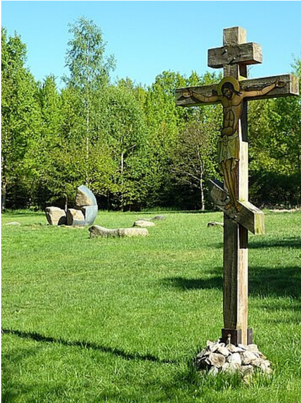
A wooden orthodox cross set up by survivors after the war to commemorate their suffering. In the background the official memorial stone, in form of a shattered sphere