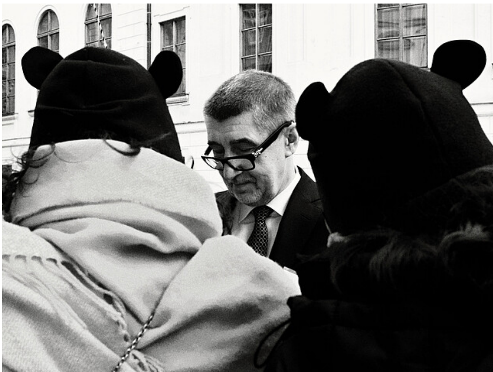
Then Prime Minister Babiš meeting protesters during a performance of the 'Romane Kale Panthera' artist group in 2018